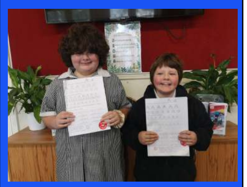
Wonderful Rūaumoko & Tāne Mahuta writers

Well done to the following for their focus and positive attitude towards their learning.