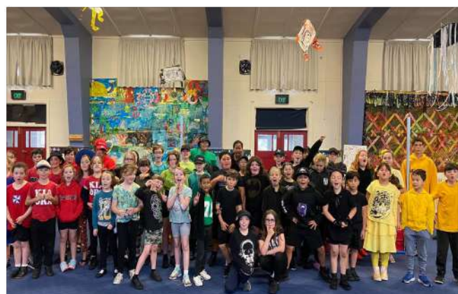
Bathgate Park School students looking fabulous in their whānau house colours for Athletics Day.